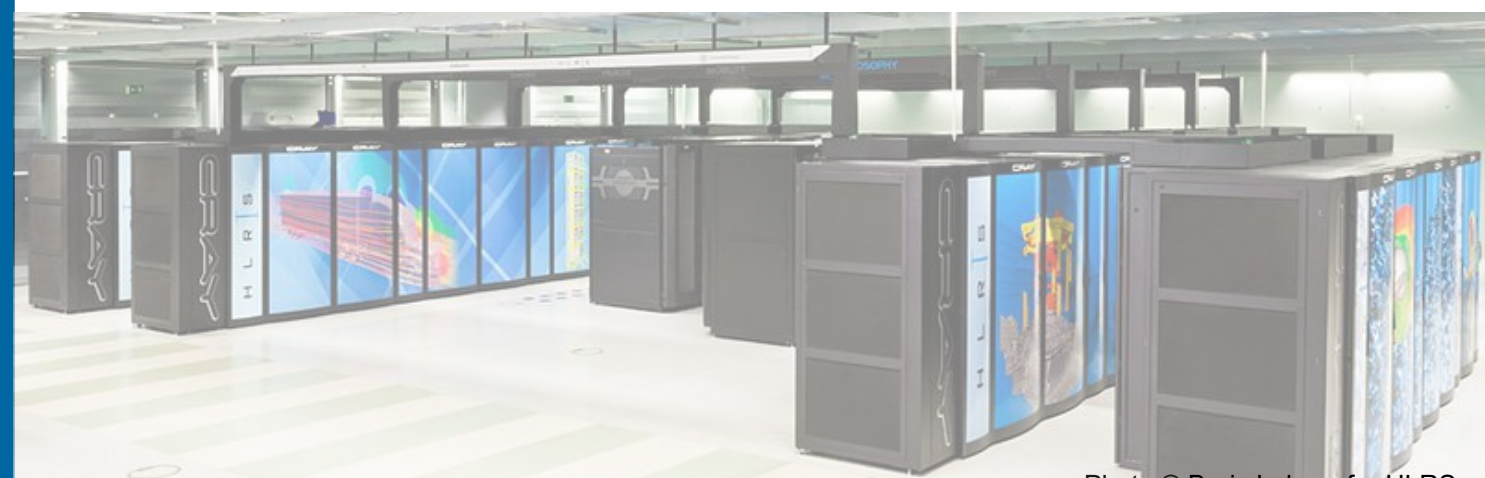
HLRS' Hazel Hen is one of the HPC systems used for our simulations

HiDALGO relies on a tripartite concept in order to facilitate coupled simulations in the domain of Global Challenges. It is based on traditional High Performance Computing, High Performance Data Analytics, but also Cloud Computing resources, which are provided to the project by the three supercomputing centres HLRS, PSNC and ECMWF. Large-scale simulations are executed on the traditional High Performance Computing infrastructures, whereas Big Data analytics and Machine Learning based pre- and post-processing workflows are served by specific High Performance Data Analytics environments. These infrastructures are connected to remote Cloud services in order to foster local processing capabilities. Consequently, a spatially distributed compute service is built up within the frame of the project that follows an innovative approach for leveraging modern data-centric computing.